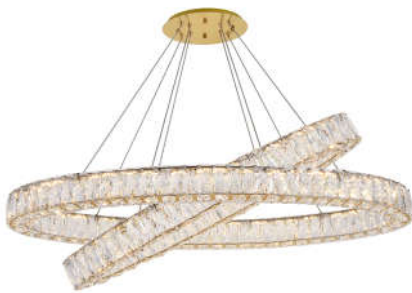
Gold Item No:3503D40G