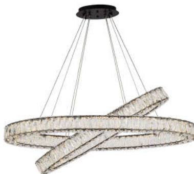
Black Item No:3503D40BK